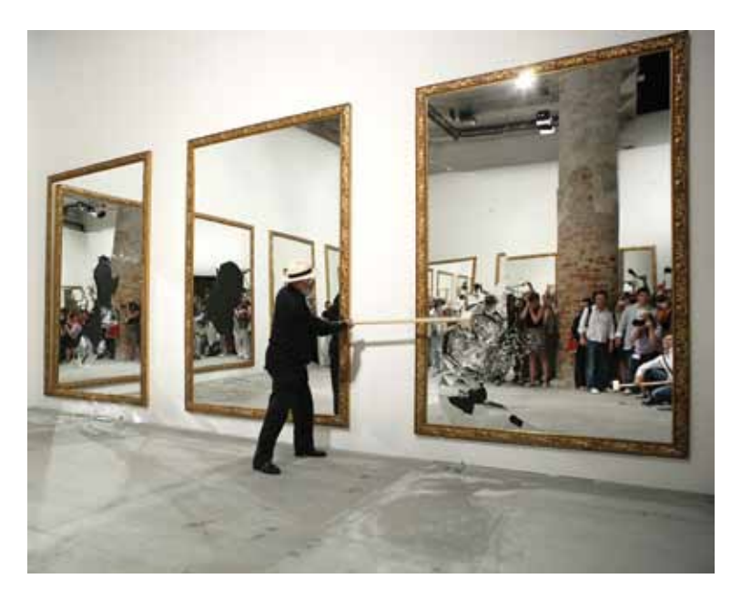
Michelangelo Pistoletto Twenty two Less Two, 2009 Mirror, wood, 22 elements, 300 x 200 cm each Courtesy the artist and Galleria Continua, San Gimignano / Beijing / Le Moulin Photo: Ela Bialkowska